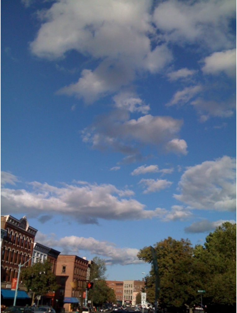
Figure 1.1.