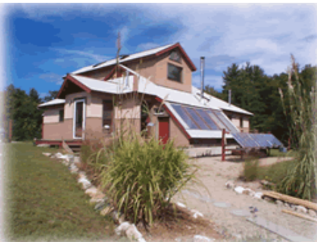
Figure 3.1.

Autumn Inn This New England Colonial Inn is conveniently located within walking distance to downtown Northampton and Smith College. 32 relaxing and cozy rooms are available with standard hotel amenities. The inn is entirely nonsmoking. 259 Elm Street 413.584.7660