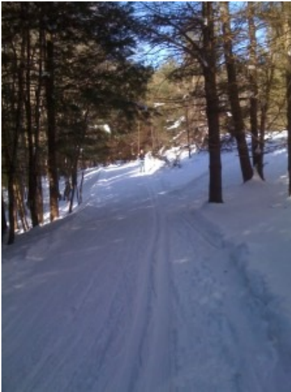
Figure 9.3.