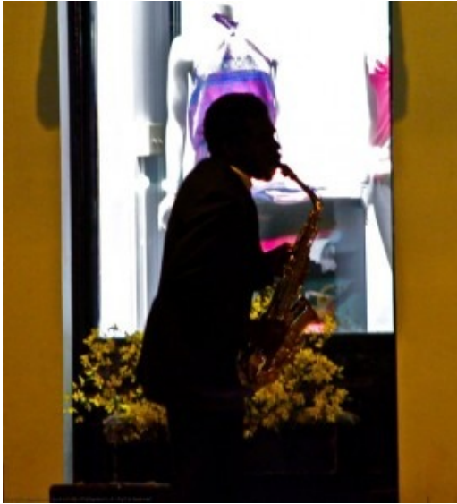
Figure 9.1.

Dr. Sketchy's Northampton Happens every first Friday of each month, with a different theme. Get your sketching on, while sipping your favorite libation. At the Elevens. Small cover charge and have some bills ready to tip the models.