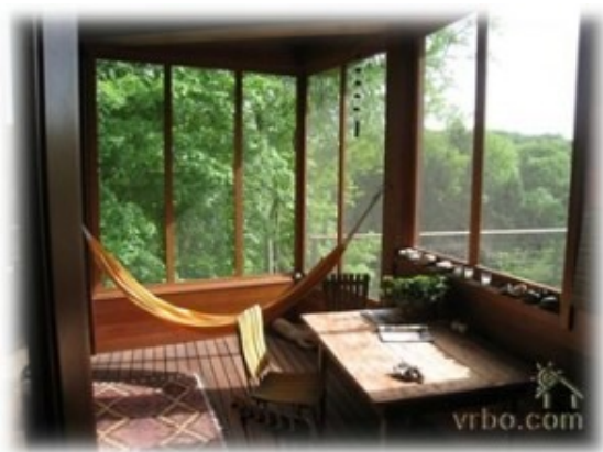
Figure 3.2.

Beautiful Farmhouse with Lovely Views This renovated farmhouse is located on one and a half acres of land and surrounded by many acres of open farmland and stunning views of fields. Sunsets are spectacular and we offer