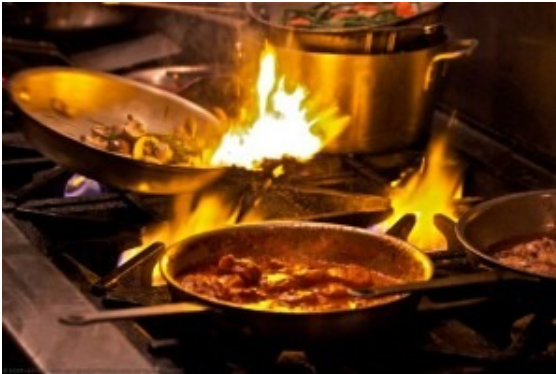
Figure 4.2.