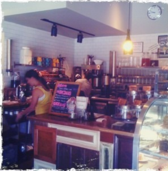
Figure 4.1.