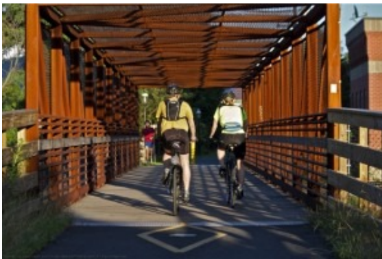
Figure 9.2.

Smith College Be sure to include a walk around the campus, as part of your trip to Northampton. Additionally, there are all sorts of events and activities at Smith. Down by the boathouse and lagoon, you can follow the path and