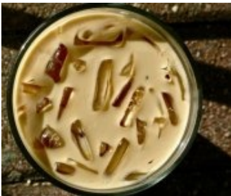
Figure 6.1.

Woodstar Café Fresh healthy baked goods, coffees, teas and other treats.