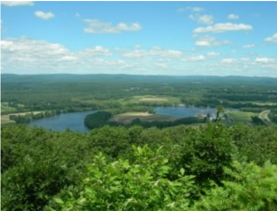
Figure 2.1.

Note: Northampton meter maids are notorious for raising the city's revenue by means of parking tickets. Public parking is available downtown in designated lots and via street meters-which require plenty of change. Off street parking is